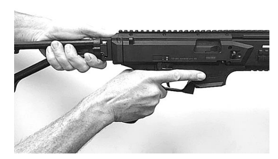
Left Folding Stock